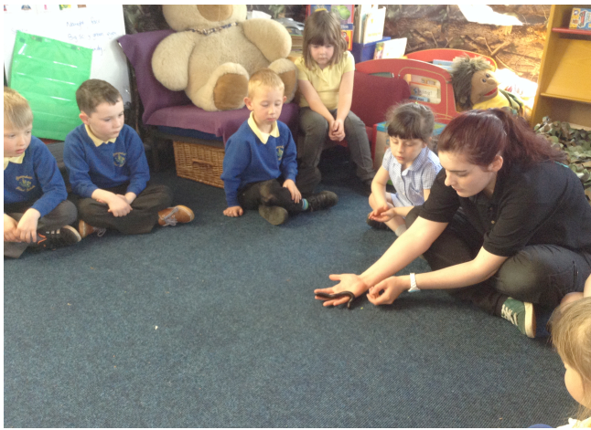
Children enjoying the recent visit by Zoolab.

Congratulations to the following children who were all winners in the Decorated Egg Competition: